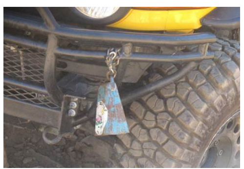
Proudly displaying the Cow Bell.