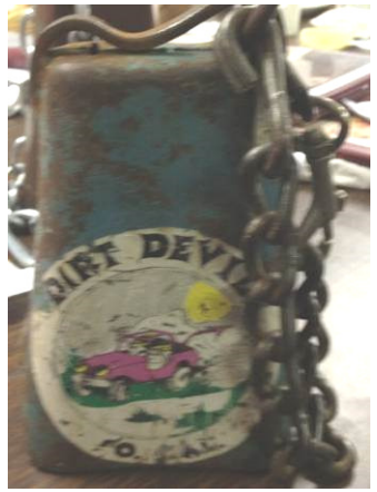
1 Old green cow bell.

Old Blue Mike Maneth Calico February 2012