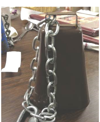
3 new brown bell

The cow bell rules are: If you get stuck and are unable to move under your own power and need the help of a winch or you get strapped from one of your fellow jeepers then you have earned the privilege of hanging a cow bell from your front bumper. You must leave the cow bell on the front of your rig until another Dirt Devil gets stuck then, you can proudly hand it over.