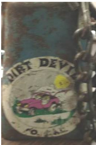
Old Logo Green