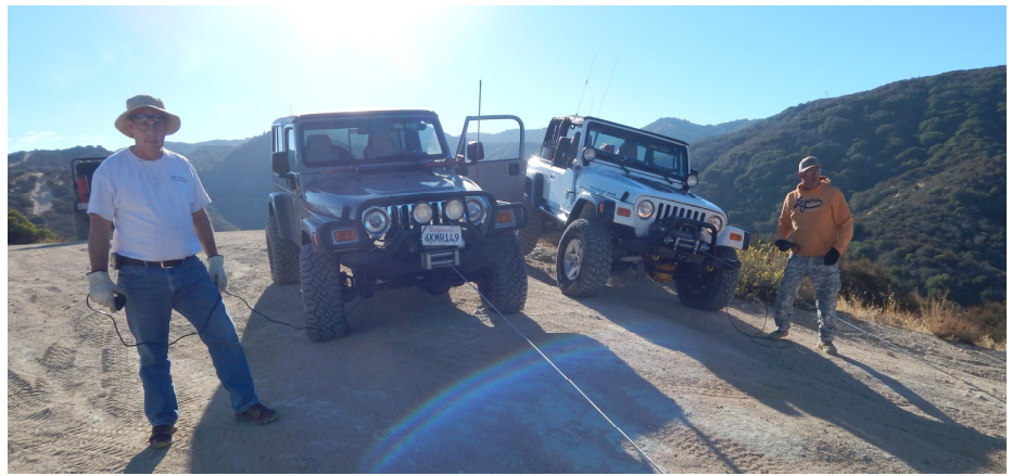
The team ready to save a Dirt Devil in distress.