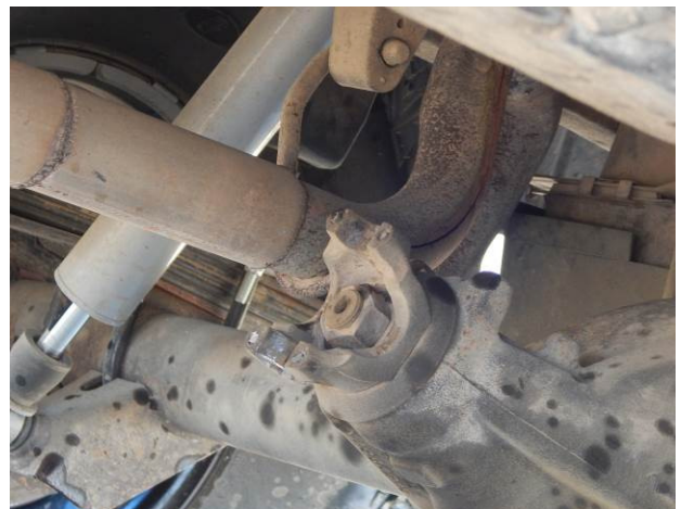
broken U joint