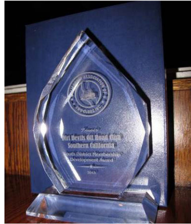
CAL 4 Wheel Drive, new member award