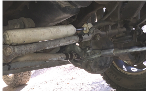
winch cable used to straighten the tie rod.