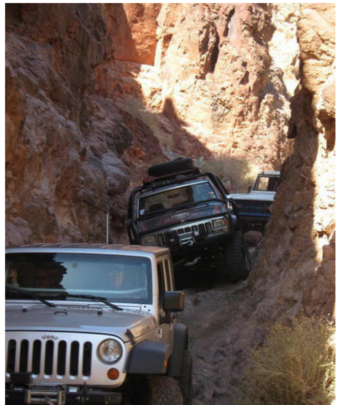
Calico December 5 th read all about it on the last page