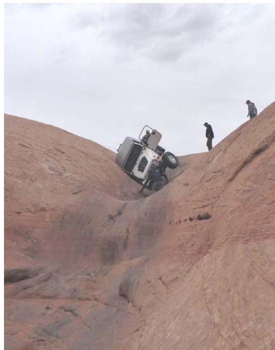
fun in Moab UT