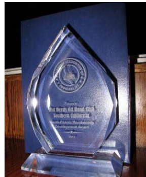
CAL 4 Wheel Drive, new member award