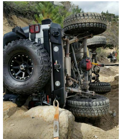
tis the season for rolling.