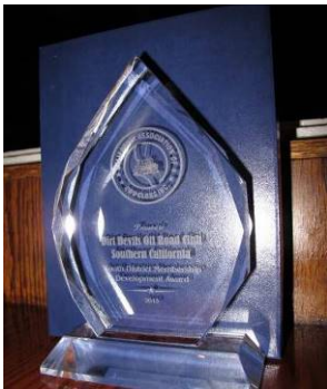
CAL 4 Wheel Drive, new member award