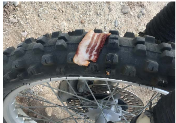
Breakfast in the desert.

Joe and I convoyed up Friday and met Pete at Whiskey Pete's where we had dinner. The rooms were newly upgraded and quite nice and comfortable. Of course, the unusual noises always corrupt my sleep. Saturday morning, we rendezvoused for a fine breakfast in the desert.