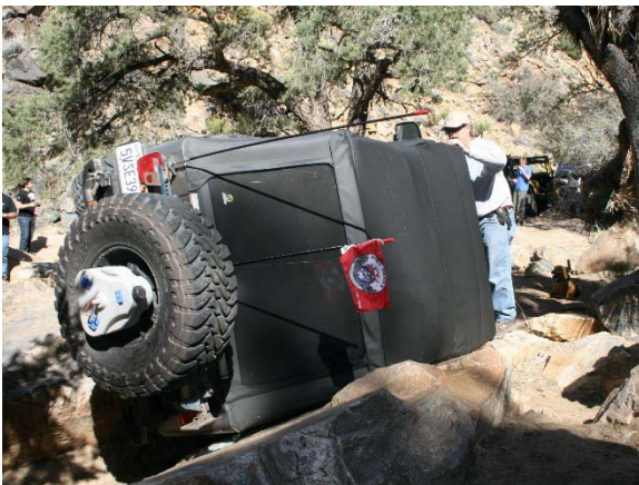
Proud owner of a cowbell.

Review next year's calendar and making your plans.