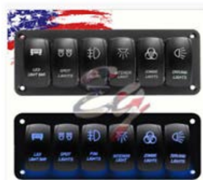
6 Bay Switch bank.

Even with the pre-made switches you will still need to run your wiring, so really you're paying for the bank and the control box, both of which can be built by you with a little work in the evening on your part. I have found a water tight fuse bank with 5 relays and fuses on eBay, it is going for $115.00, but I want a 6-bank block for this install and I want it on the cheap. I kept looking and found a Mazda fuse box for $50.00, I have to look into it more, but it might just work perfect for my needs, more to come on that.